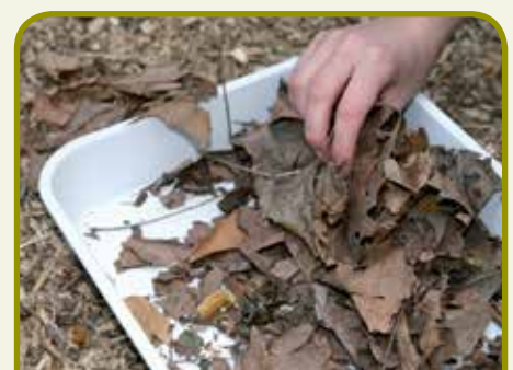
...among dead leaves