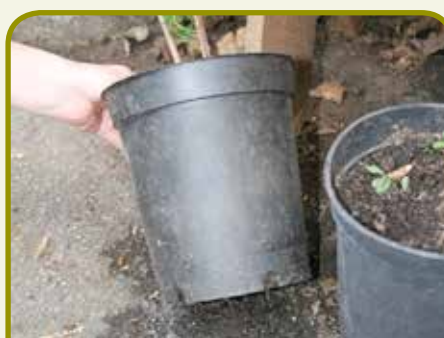
...under plant pots