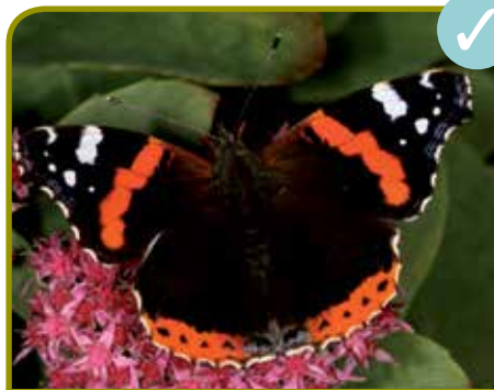
Red admiral butterfly