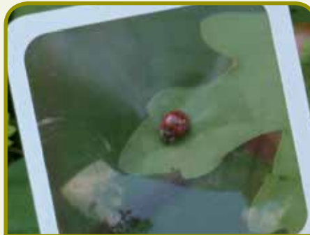
...on leaves and stems