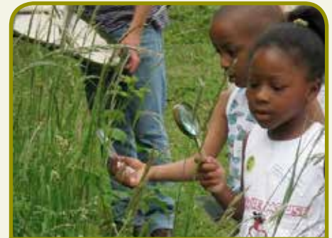
...in long grass