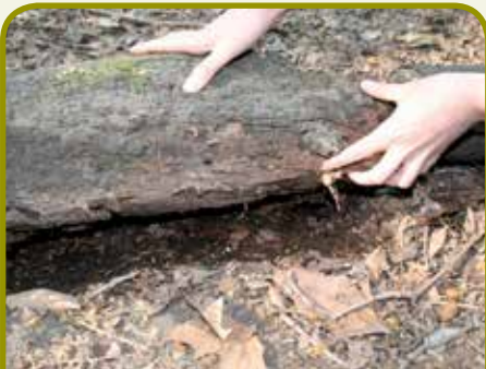
...under logs and stones